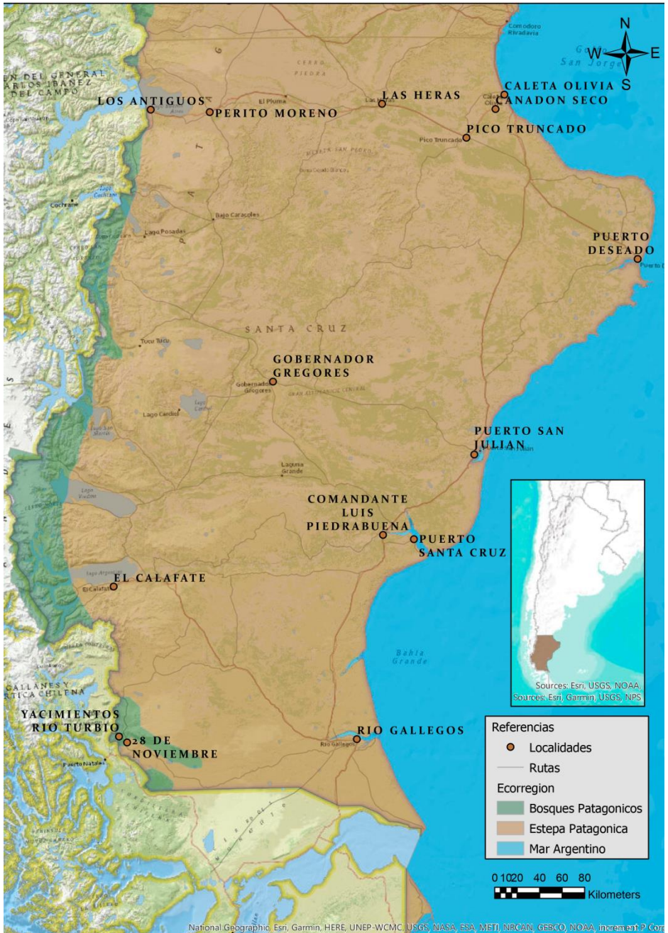
Map of Santa Cruz, Patagonia Argentina