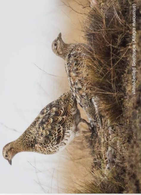
White-bellied Seedsnipe ( Attagis malouinus )